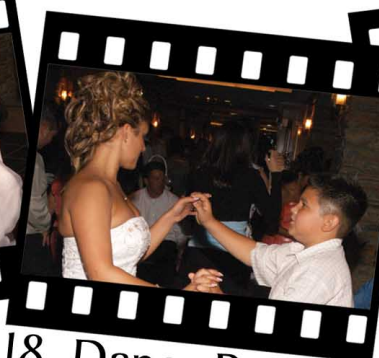
18. Dance Party (Montage of highlights)