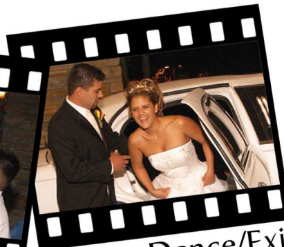
19. Last Dance/Exit (Real time coverage of the end of your special day)