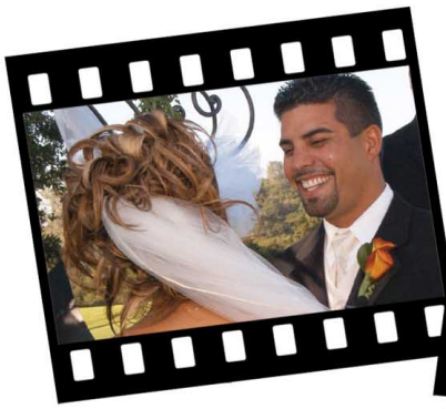
5. Vows (Real time coverage of your vows from three angles)