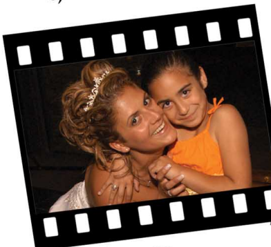
13. Dinner (Montage of clips of food being served, you going around greeting guests)