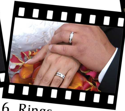
6. Rings (Real time coverage of your exchange)