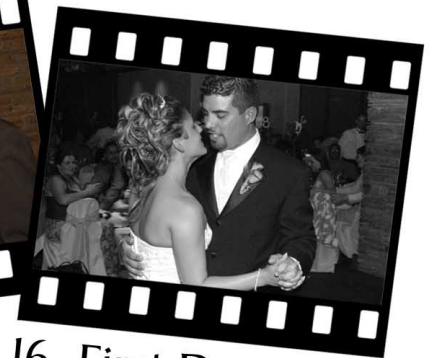
16. First Dance (Real time coverage from two angles)