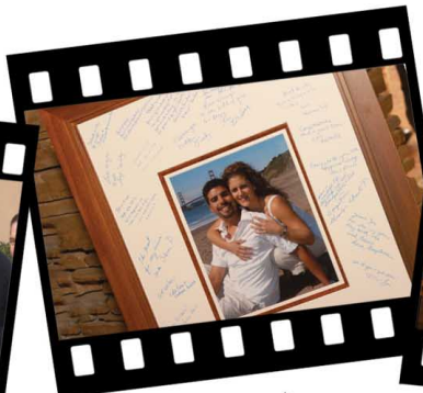
10. Reception (Montage of clips of your reception location, how it's decorated, cocktail hour, guests mingling)