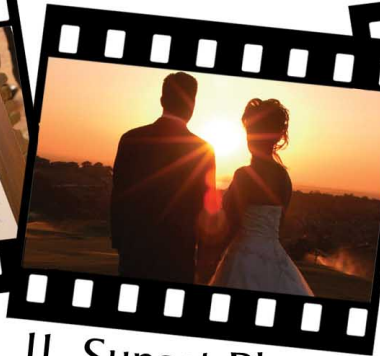
11. Sunset Photos (Montage of clips of your photoshoot)