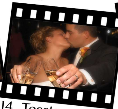
14. Toasts (Real time coverage of the person toasting & your reaction)