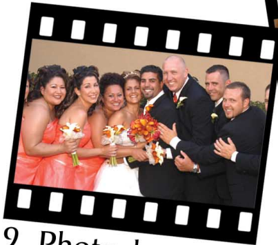
9. Photoshoot (Montage of clips of your photoshoot including special effects)