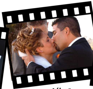
7. First Kiss (Real time coverage)