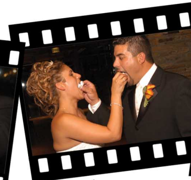
15. Cake (Real time coverage from two angles)