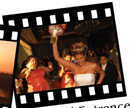
12. Grand Entrance (Real time coverage of the bridal party entrance and your grand entrance)